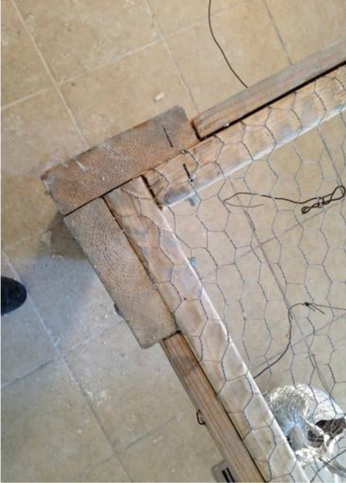
WHEN THINGS GO BAD, INC.